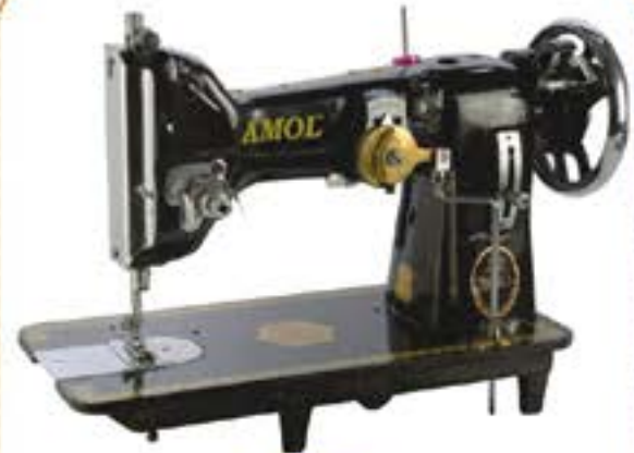
AMOL Pico Designer