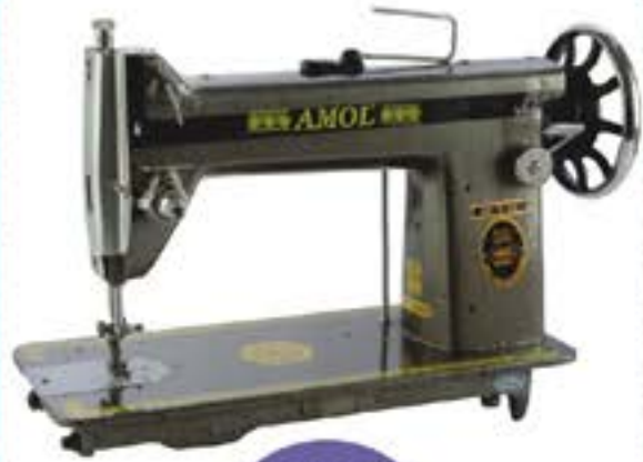
AMOL 95-T-10 Square Arm