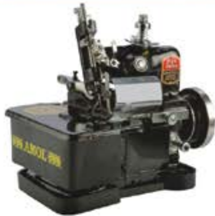
AMOL Overlock Machine