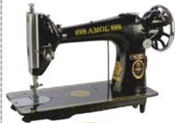
AMOL TA-1 (Industrial)