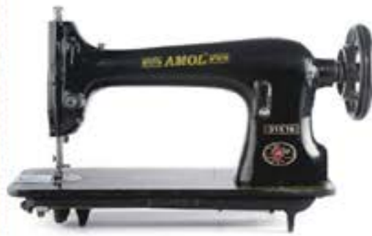
AMOL 31 K Leather Stich