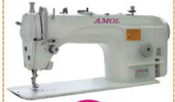
AMOL Garment sewing Machines